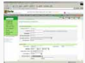
[ Administration ]