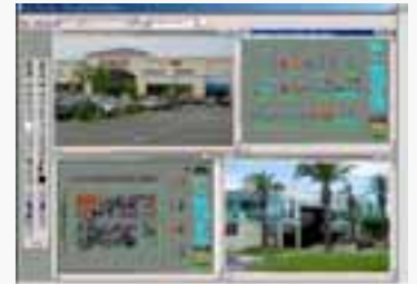
[ Powerful Viewer ]