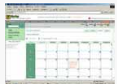
[ Schedule / Calendar ]