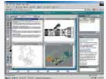
[ On Line Conference ]