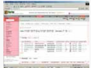
[ Document Management ]