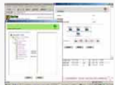
[ Workflow & Webform ]