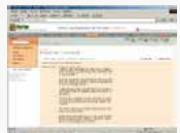
[ Forum & Flea Market ]