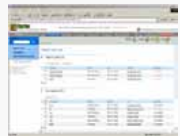
[ To Do List ]