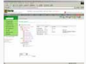
[ Member Search ]