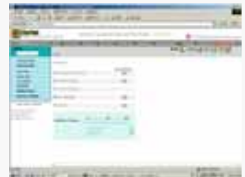
[ E-Mail ]